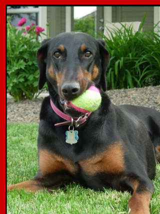
Meet Oni—our 100th Mission Accomplished!