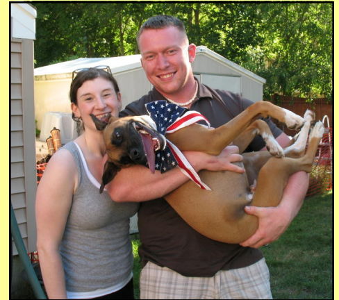
Stabler (above) reunited with family Buddy and Buttercup (below) reunited with family